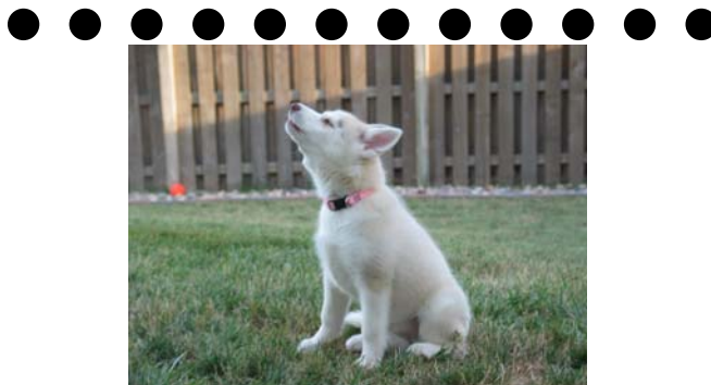
Jessie's (Ch. Alcinta's Hurricane Brimstone) baby girl

Mail non-newsletter correspondence to: Arizona Mountain Mushers, P.O. Box 30983, Flagstaff, AZ 86003-0983.