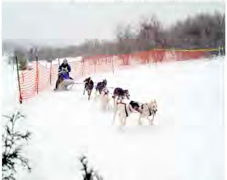
Lynn with six dog team at Lone Pine Race