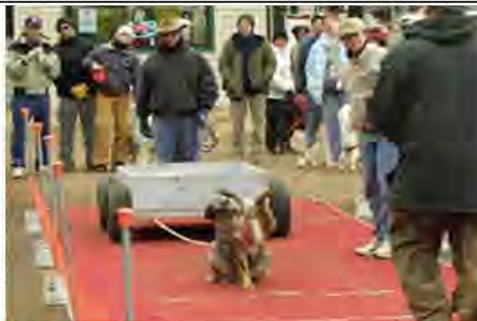
A cute Aussie waves his paw at his handler at the Sunrise Weight Pull—who does he belong to?

Have you visited our AMM website? http://hometown.aol.com/azmtmusers/AMMhomepage.htm