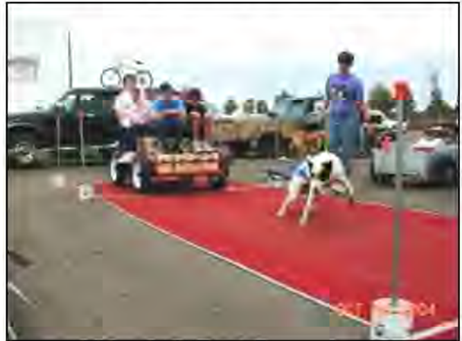
Goliath pulling at the Flagstaff Weightpull!