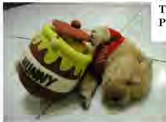
Winnie The Pup